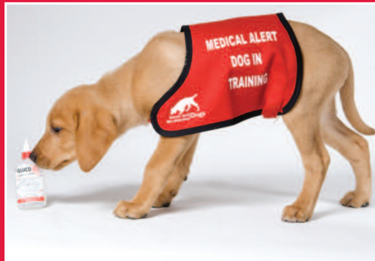
Dizzy named by www.dizzy.org.uk