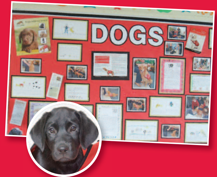
Claydon named by the children at East Claydon School

Your thank you pack will include a framed photograph of the puppy you have named. During his training you will receive puppy and charity updates as well as being invited to meet him.